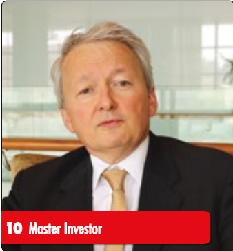
10 Master Investor