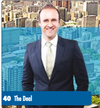
40 The Deal